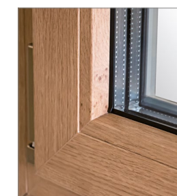
Squared glazing bead