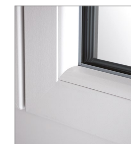
Round glazing bead